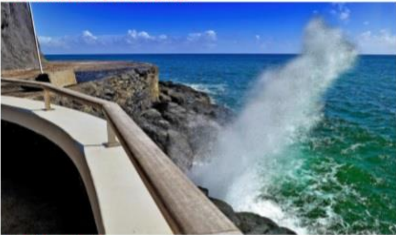
The blow hole