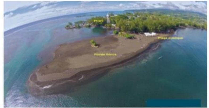
The venus Point and the light house