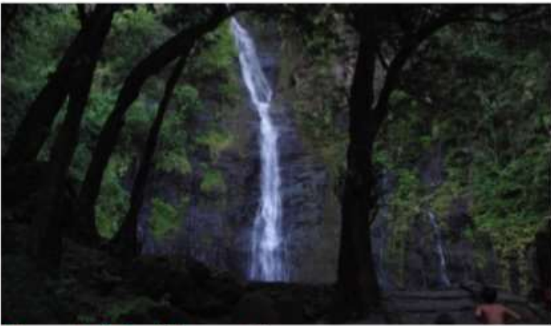
The waterfall of Faarumai