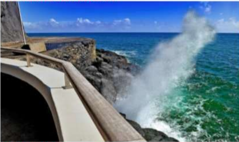
The blow hole