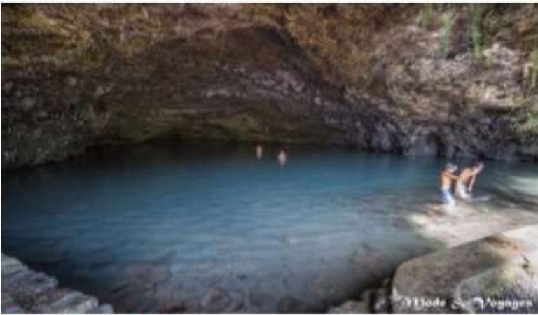
The grottos of Maraa