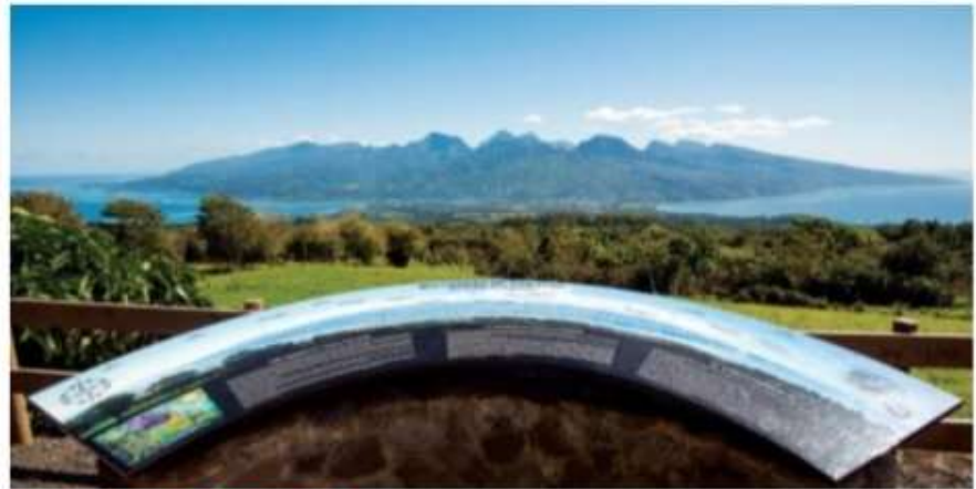
Belvedere of Taravao