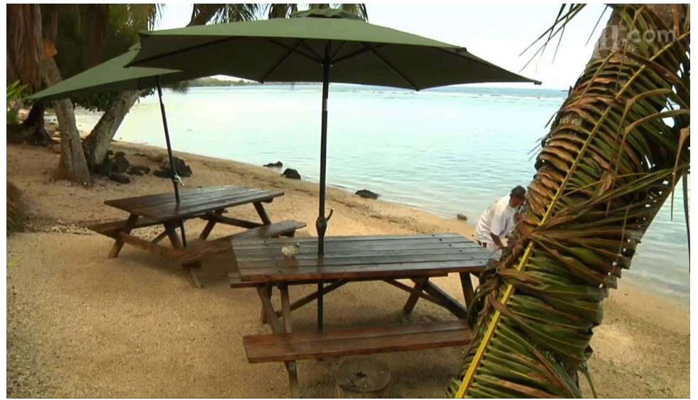
The beach of vairao